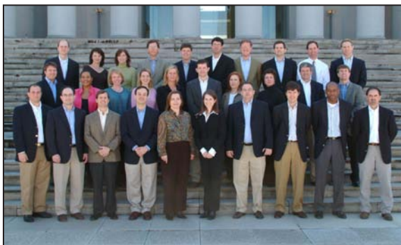
Leadership Forum 2007 – Class 3