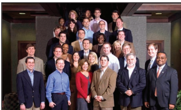
Leadership Forum 2008 – Class 4