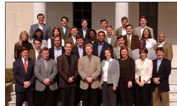
Leadership Forum 2006 – Class 2