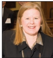
Hon. Sue Bell Cobb