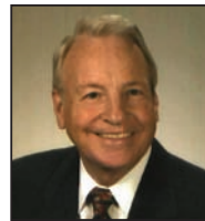
Gov. Albert Brewer