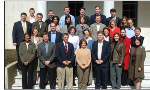
Leadership Forum 2005 – Class 1