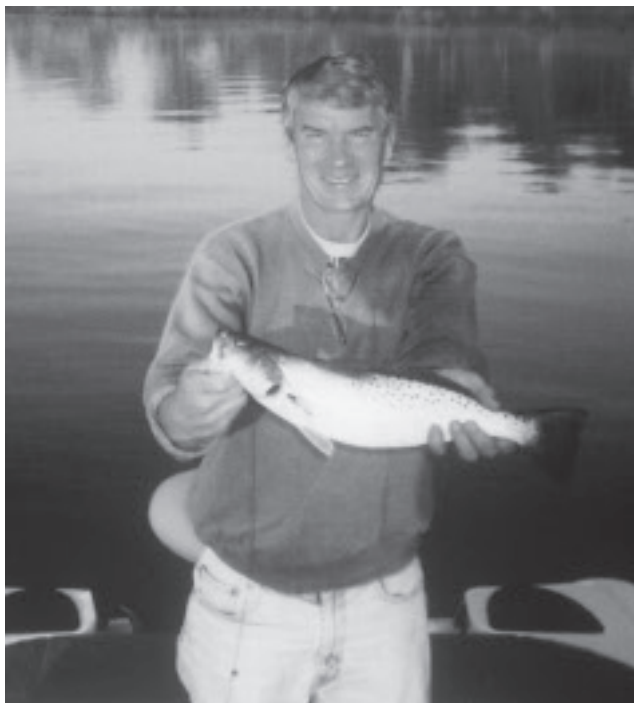
Gone fishin' (nice speckled trout!)