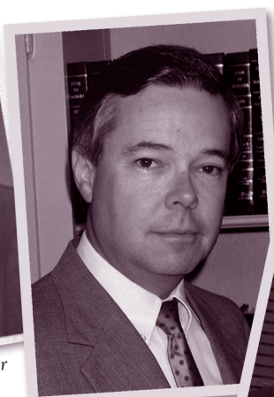
...when he took over editorial duties in 1983...