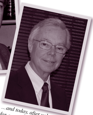
...and today, after volunteering for over two decades.