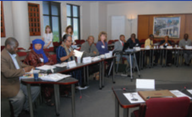
Visitors included lawyers, judges, government officials, municipal leaders, military leaders, representatives of non-governmental organizations, and human rights groups.