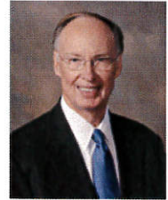
Governor Robert Bentley

Headquarters 226th Combat Communications Group Abston ANG Group 1000 Air Base Blvd Montgomery, AL 36108-0348 (334) 240-1400