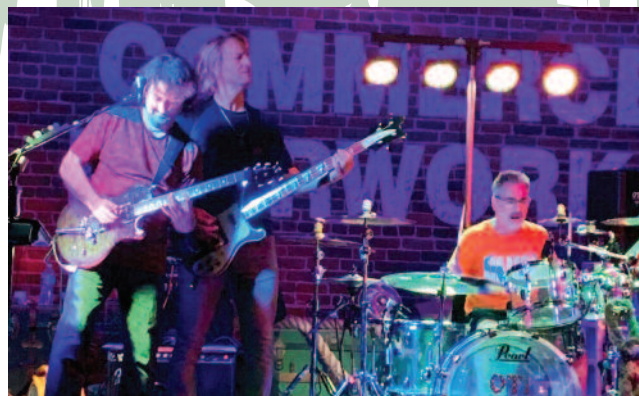
Outside the Inside

Outside the Inside band sponsored by Attorneys Insurance Mutual of the South, Inc.