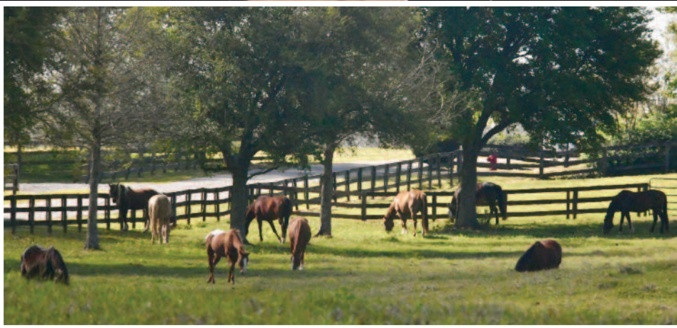
Baldwin County photos throughout this PROGRAM courtesy of Louis Mapp