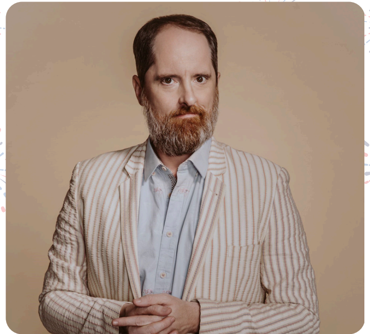
BRENDAN HUNT, CO-CREATED AND STARRED IN TED LASSO